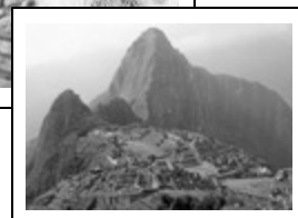
Machu Picchu City in the Clouds