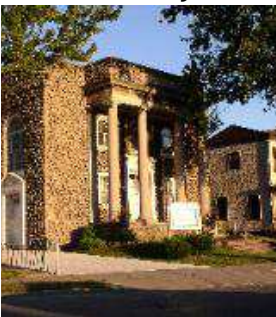
UU Church of Niagara

Hear the roar! Feel the mist! See the mighty Falls! Join UUs from around the country in Niagara Falls 19-22 July 2009. Come experience the wonder of Niagara Falls including some great educational opportunities while being taken care of like royalty. The UU Church of Niagara is conducting a four day UU Niagara Experience which is a lifetime opportunity to encounter the Falls up close from every perspective. Spend four days with us exploring the rich history and natural beauty around the Falls. For information visit our website < www.uunex.net >.